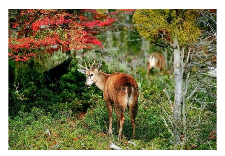
Fig. 1. Male huemul during autumn in forest habitat.

Huemul have been fragmented into small and mostly isolated subpopulations, and the remaining 350-500 huemul in Argentina are dispersed in some 50 subpopulations along 2000 km of Andes mountains [1], [2]. For both countries, total numbers are roughly estimated at 1500, there are continued losses of subpopulations even within protected areas, and the status is considered critically endangered, especially in Argentina [1], [2]. This cervid living in remote subpopulations at low-density thus constrains field research efficacy. Yet skeletal remains collected between 1993-2007 provided many incidences of bone disease which contribute to morbidity: osteopathy among adults occurred in at least 57%, with affected individuals having mandibular (63%), maxillary (100%), and appendicular lesions (78%) [4]. Because of distortions, malocclusions, or loss of teeth, eating becomes more difficult and likely is painful. These lesions would affect the ability to avoid predators, possibly explaining the low average adult age (3.1 years), and lack of population recovery. Primary etiologic factors like senescence, gender, fulminating infections, congenital anomalies, parasitism or marasmus, fluorosis, and disorders of metabolic, endocrine, genetic, or neurologic origins were discarded [4].