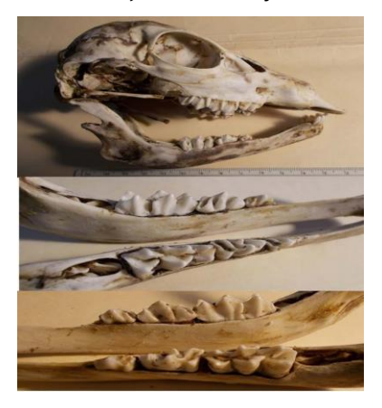
Fig. 4. Skull from the fawn recovered in 1999: no perforations on either side of the left and right mandibular bones. Although oral pathophysiognomy in huemul could be indicative of infections as a primary problem, an alternative

Cranial bone lesions are symptomatic for various different causative factors. This pathophysiognomy of mandibular and maxillary bones observed in huemul has been described among other ruminants including cervids. Characteristically there are swollen jaws or cheeks and necrotic lesions which is commonly diagnosed as Lumpy jaw [18]. A major causative organism ( Actinomyces bovis ) of Lumpy jaw normally occurs as opportunist in the mouth flora of all healthy animals, and its occurrence is frequent among deer [18]. Lumpy jaw can lead to high mortality rates in fawns [18], but older animals were significantly more likely to be affected than younger ones. However, mainly individuals stressed by poor diet, especially like nutrient imbalances such as food scarcity, mineral and trace element deficiencies, or high population density and other factors, would therefore, exhibit a higher susceptibility by becoming immunodepressed. Nevertheless, wound healing in healthy individuals normally proceeds fast enough such that the infectious processes terminate soon, and without causing pathological bone remodeling. Instructively, there are no reported examples of fetal and neonatal cases of ruminants infected with A. bovis . A broad study of a deer population affected by A. bovis found no evidence in 14679 fawn jaws, and only documented cases among adults [19].