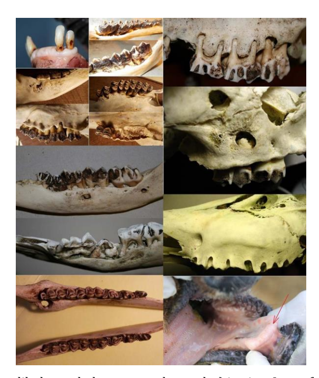
Fig. 2. Examples of maxillomandibular pathology among huemul. a) in vivo: Loss of 4 and 8 incisive teeth (top left and bottom right). b) Postmortem: perforations and reduced bone thickness which expose tooth roots, defective keletogenesis and bone absorption, possibly exacerbated by a secondary reaction to infections.

Osteopathology equivalent to those in Argentine huemul has been shown to co-occur with Se deficiency in Chilean huemul [11], with 73% deficient and 64% severely deficient cases, coinciding with documented Se deficient plants and livestock, including the occurrence of severe muscular dystrophy [12]. With the first-ever group of huemul captured and marked in Argentina (2017), three males and three females plus a fresh carcass showed that 86% were diseased with clinical pathophysiognomy included lameness, affected hooves, exfoliation of 2-7 incisors, other cranial osteopathologies (Fig. 2), and muscle atrophy [13]. Subsequently, three females and two males were captured and translocated to the recently established first-ever Rehabilitation and Breeding Station Shoonem for huemul in Argentina (2022). One male had already lost all incisive teeth (Fig. 2, bottom right); another male had lost both central incisive teeth with additional incisive teeth being loose and with partially exposed roots; two females had all incisive and canine teeth, but with additional incisive teeth being loose and with partially exposed roots; and a third female had lost both middle incisive teeth with additional incisives being loose. This pattern thus coincides with previous observations on adults (Fig. 2) based on bone remains and earlier live captures [4], [13].