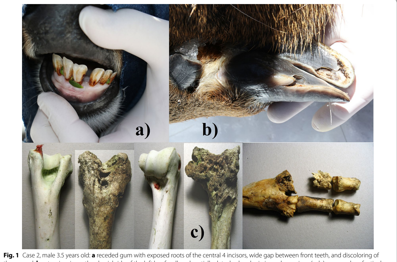
Fig. 1 Case 2, male 3.5 years old: a receded gum with exposed roots of the central 4 incisors, wide gap between front teeth, and discoloring of the enamel; b extensive rip on the abaxial side of the left hoof wall, and partially detached and missing subunguinus (sole); c examples of articular lesions from dead huemul of this subpopulation, including foot and humerus [2]

exposed roots, reduced jaw height, an extensive perforation of the left mandibular body (lingual), and probably secondary infections (Fig. 3b). That mandibular area had a thickened body that was transformed into osteoporotic spongy bone (Fig. 3c). The skull showed bone resorption from necrosis exposing roots of several maxillary molars and premolars, erosions of the palate resulting in porosification and even perforations, and extensive erosion of alveolar pockets (Fig. 3d, e). Without soft tissue, several teeth exfoliated. Some vertebras were asymmetrical.