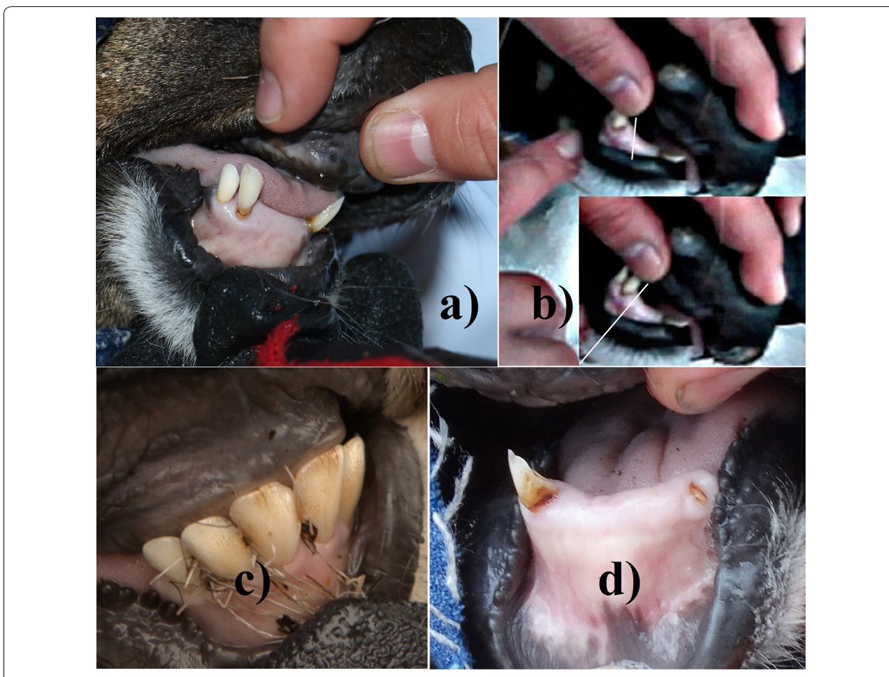
Fig. 2 a Case 3, female 3.5 years old: loss of 4 central incisors with gums healed over, receded gum and exposed roots of remaining teeth; b remaining teeth where completely lose with tips moving about 10 mm; c Case 4, female 1.5 years old: damaged front teeth showing pitting and brown staining, incisors with several vertical fissures 2–3 mm in length, and absent canines; d Case 5, male 4–5 years old: only 1 front tooth remains; the right canine is broken and only part of the root of the left canine remains at gum level

Given the fresh dead huemul had not only lost incisors, but also exhibited severe mandibular and maxillary lesions, the other diseased but live individuals most certainly have similar additional lesions. These exfoliated front teeth resemble periodontosis ("broken-mouth") described in sheep [11], except that symptoms in huemul also include lesions of premolars and molars, and affected young individuals. Observations of additional huemul at close distances revealed asymmetrical velvet growth and lumps beneath mandibles: therefore, likely other cases affected by clinical disease. Reduced foraging efficiency via exfoliated incisive teeth presents the most parsimonious explanation for observed impacts on body condition, low average age of 3.1 years [2], and recruitment rates too low to allow re-colonization of habitats used historically.