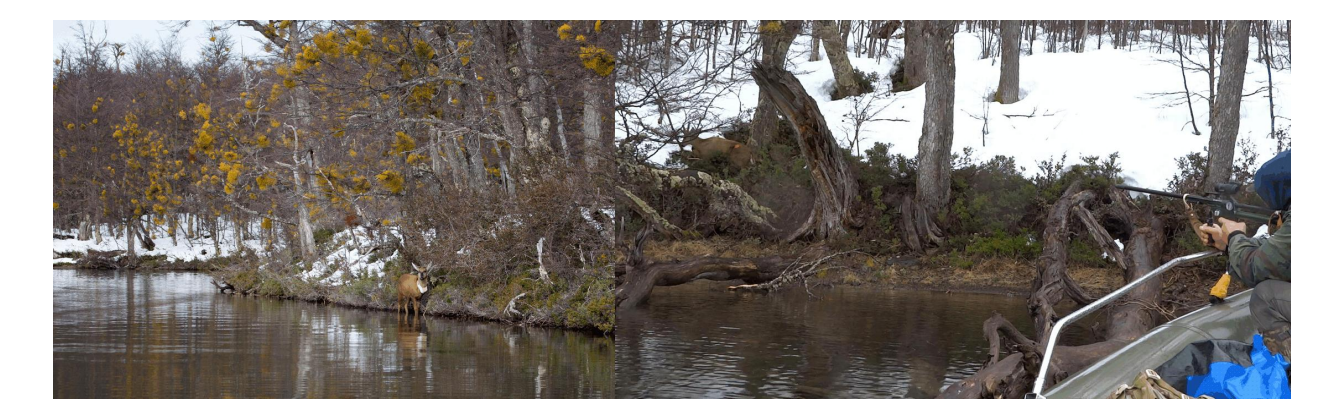
Figure 1. A) Huemul at La Plata Lake were often found walking through the water at the shoreline when deep snow was present; B) Darting a huemul from a boat on La Plata Lake.

The study area covers the north, south and western sides of the La Plata Lake, an Andean lake at 930m elevation inside Shoonem Protected Park in southern Chubut province. The mountains surrounding the lake, on all but the eastern side, define the Chilean/Argentine border. The dominant mountains of the landscape include Dedo (2020 m) and Colorado Plata (1796 m) to the north and Condor (1996 m) and Catedral (2067 m) to the south; the mountains to the west are between 1300 and 1700 m, all with precipitous rock walls. The primary habitat is temperate woodland dominated by lenga, Nothofagus pumilio , situated between 930 and 1400 m.a.s.l. with a light understory predominating in shrubs: Pernettya mucronata, Maytenus disticha and Berberis spp. The climate is temperate and marked year round by persistent westerly winds with an average annual precipitation of 1000 mm. The warmest and driest months are December through February with an average monthly precipitation of 50 to 100 mm. Meanwhile, the average precipitation for the months of June through August is from 200 to 350 mm, principally as snow. The average temperature for the hottest month, January, is 8 to 10° C, while the coldest month, July, has average temperatures of -4 to -2° C.